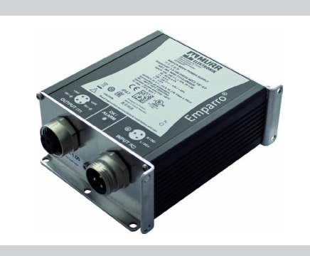
Figure 2: Suppliers like Murrelektronik created power supplies like the Emparro67 Model shown here to meet Class 2 requirements, although this approach is typically limited to less than about 4A power supply.

Because intelligent power distribution devices perform their ECP function using digital methods, the protection actually reacts faster than other physical methods such as fuses or traditional circuit breakers. The response is more reliable than the trip curve of a