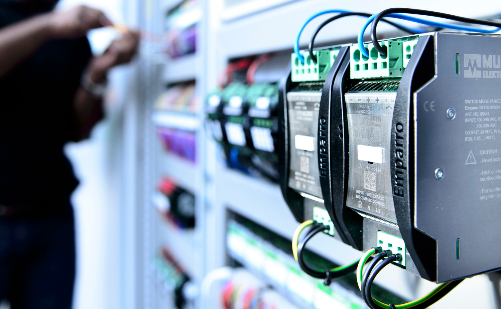
Figure 1: Control circuit power distribution is a relatively mature field, but new devices and installation practices can provide many advantages.

Standards related to power supply and distribution are generally intended to protect personnel, and to prevent fires or any potentially unsafe or damaging conditions. The design principles and applicable products are well understood, but sometimes the standards change or newer products become available, providing options for improvement (Figure 1).