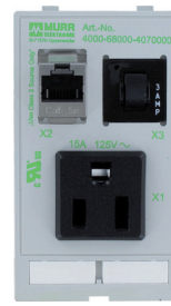
Power/RJ45/3A Fuse 4000-68000-4070000