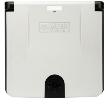
Gray Lid 4000-68524-0000001