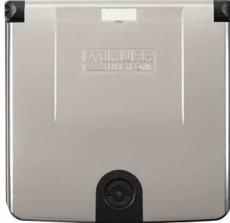
Metallic Lid 4000-68523-0000001