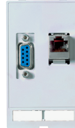
SUB D9/RJ45 4000-68000-1410000