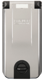
Metallic Lid 4000-68513-0000001