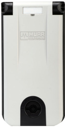
Gray Lid 4000-68514-0000001