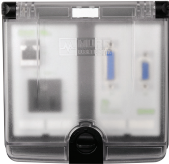
Transparent Lid 4000-68522-0000001