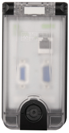
Transparent Lid 4000-68512-0000001