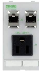
SUB D9/RJ45/USB 4000-68000-4060000