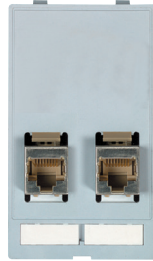
2 x RJ45 4000-68000-1200000