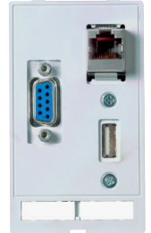
SUB D9/RJ45/USB 4000-68000-1430000