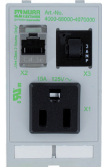
Power/RJ45/3A Fuse 4000-68000-4070000