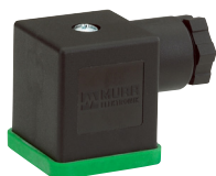
Field Wired IDC