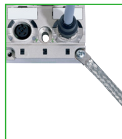
IP67 I/O Modules