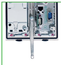
Front Panel Interface