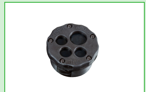
Cable Entry Plate Round