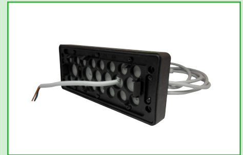
Cable Entry Plate Push Through, Self Sealing