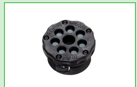
Cable Entry Plate Round