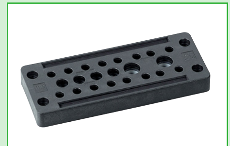
Cable Entry Plate Push Through, Self Sealing