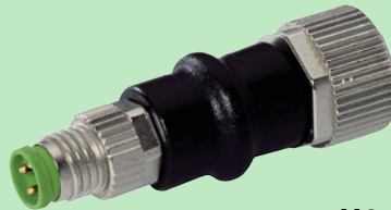
M8 - M12