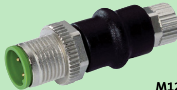
M12 - M8