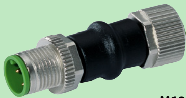
M12 - M12