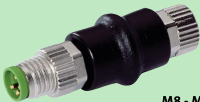
M8 - M8